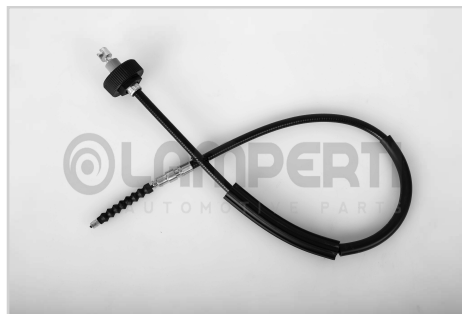
Cod. 3987 BMW 5 GT