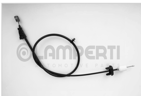
Cod. 3917 CITROEN