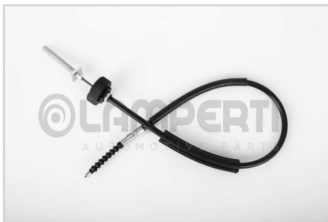
Cod. 3986 BMW 5 GT