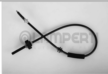
Cod. 4016 MERCEDES BENZ