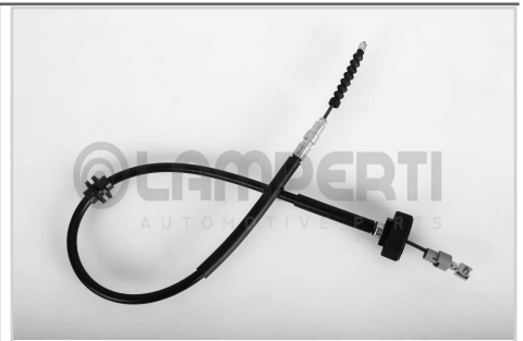
Cod. 3985 BMW X5-X6