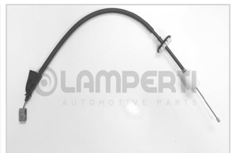
Cod. 3876 CITROEN