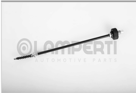
Cod. 4015 MERCEDES BENZ