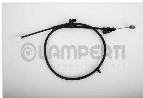
Cod. 3875 CITROEN