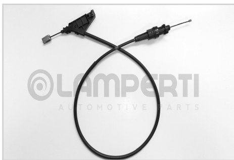
Cod. 3875 CITROEN