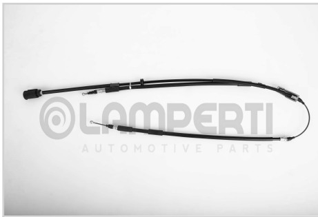
Cod. 3989 OPEL ASTRA J