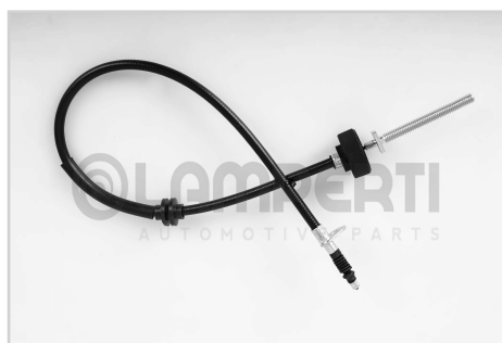
Cod. 4017 LAND ROVER