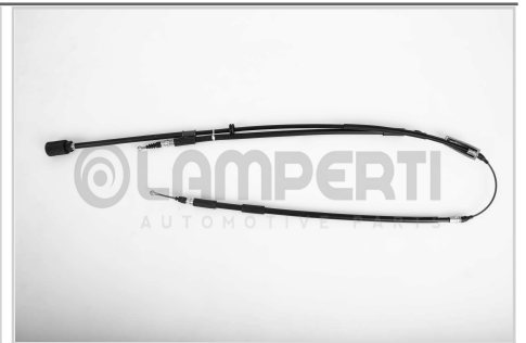
Cod. 3988 OPEL ASTRA J