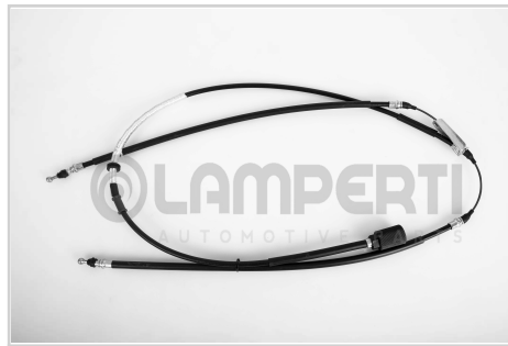
Cod. 3990 OPEL INSIGNIA