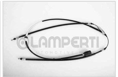
Cod. 3991 OPEL INSIGNIA