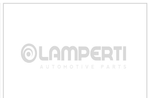
Cod. 4018 LAND ROVER