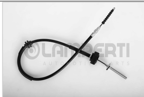
Cod. 3984 BMW X5-X6