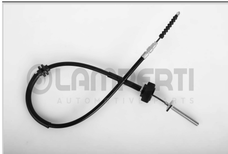
Cod. 3983 BMW X5-X6